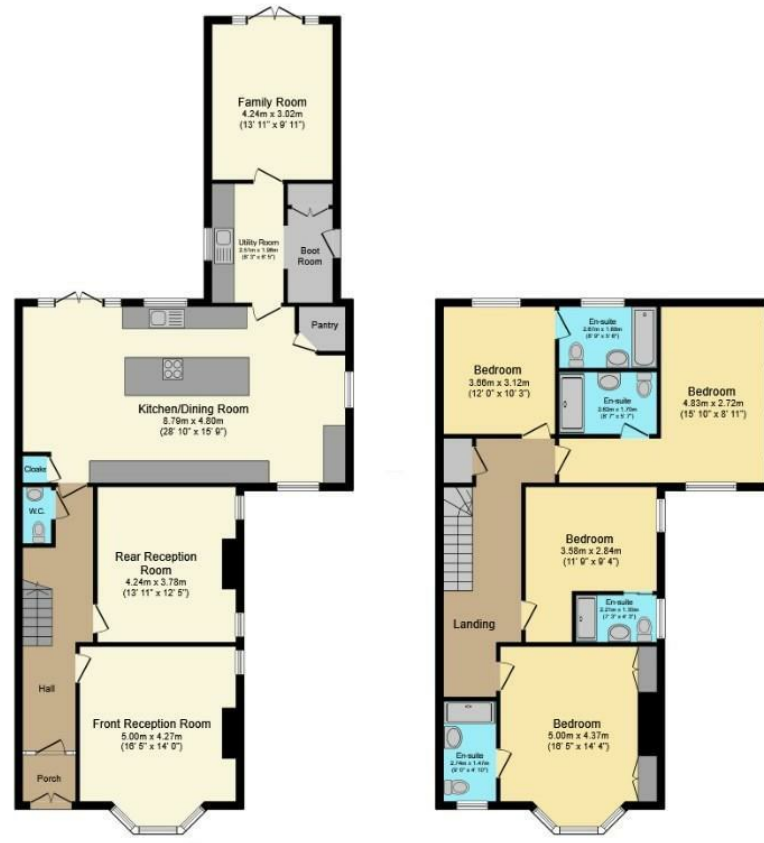
Ground Floor Floor area 119.2 sq.m. (1,283 sq.ft.)